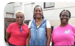
House of Praise Church