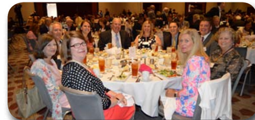
Thanks to presenting sponsor, The Hatton Foundation, 100% of funds raised at the event went directly to the Fatherhood Project.