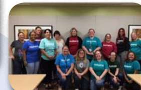
Humana Donation Drive